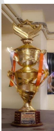
Sl. No. 3 & 5 (3 pcs) Champion (Kho-Kho) & Athletics (Men & Women Champion)