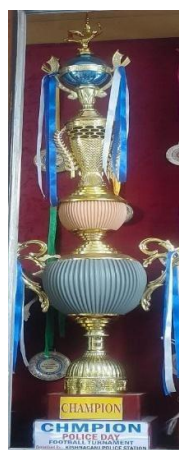
Sl. No. 1 (1 pc) Champion (Football)