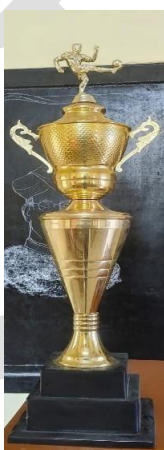
Sl. No. 2 (1 pc) Runners-up (Football)