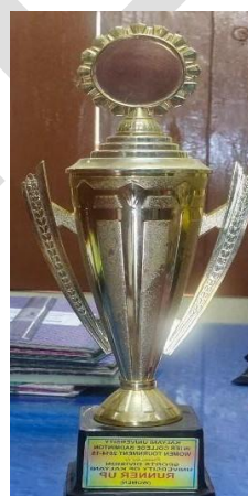
Sl. No. 4 & 6 (3 pcs) Kho-Kho (Runners-up) & Athletics (Men & Women Runners-up)