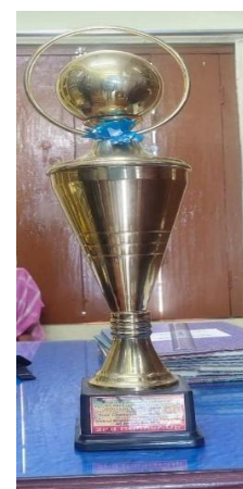
Sl. No. 7 (6 pcs) Best Athletes (Men & Women), Man of the Match & Tournament (Football & Kho-Kho)